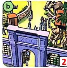
monkey / snake