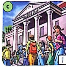
car / skeleton