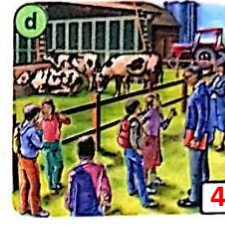
cows / a walk