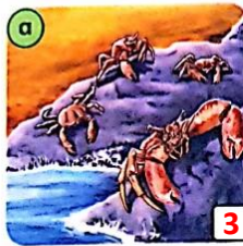
boat / plants