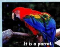
It is a parrot.

This is a bird. It is blue, green, red, and yellow. It can fly and it can sing. It can't read or write. But it can talk! This animal likes fruit and nuts. It can be a pet in a house.