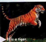
It is a tiger.